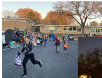
Trunk or Treat