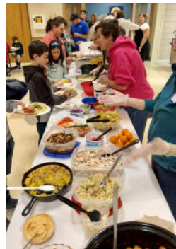
Wednesday Formation Night Potluck